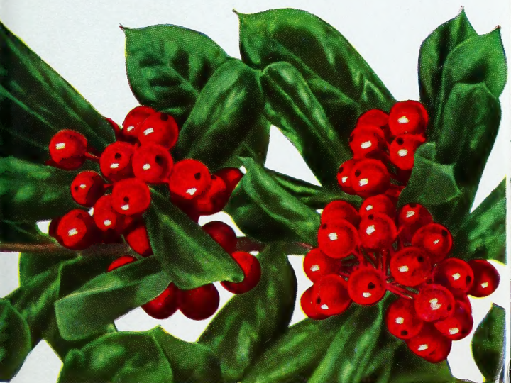
ILEX CORNUTA BURFORDI